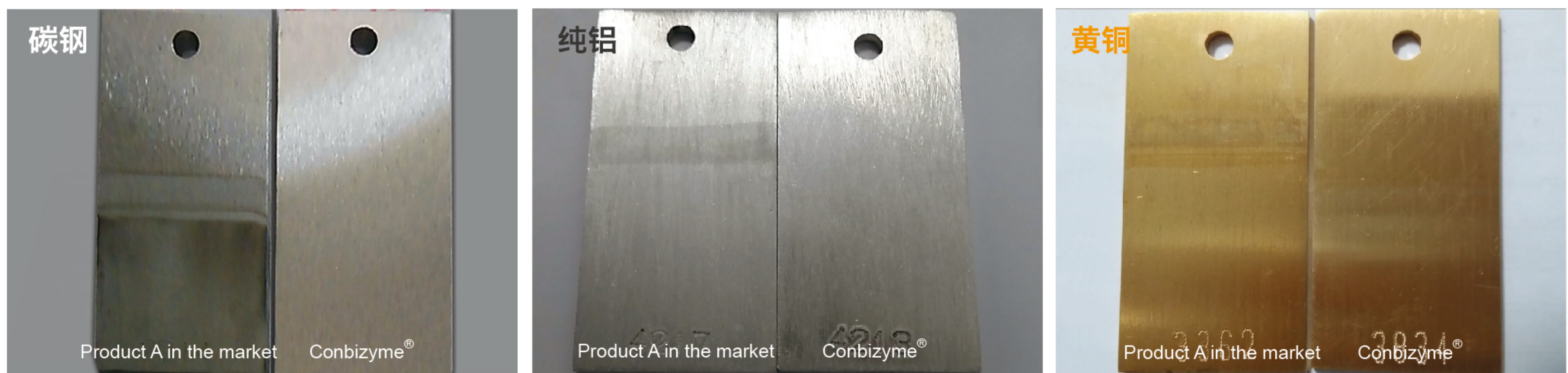
Product A in the market Conbizyme®